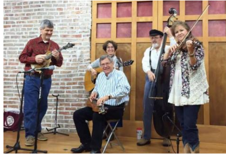
The Rackensack Musicians