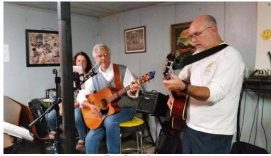
Fat Soul Band